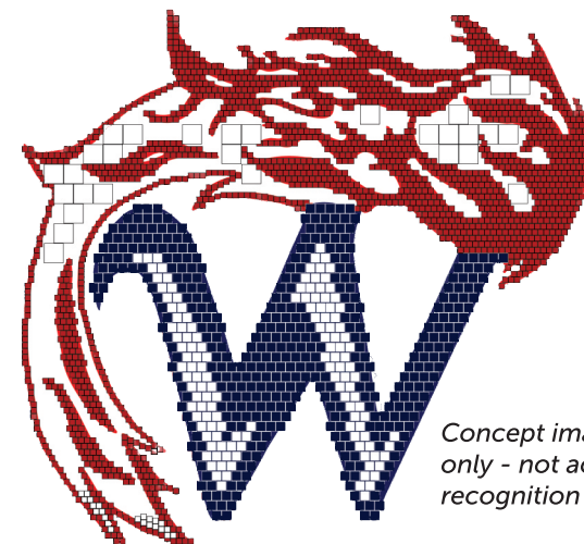
Concept image only - not actual recognition wall

Please join our efforts to improve the multi-sport venue on the high school campus. Donors who contribute at the Donor Recognition Levels noted in the box to the left will be recognized on the Comet Wall of Honor. The wall will be made up of tiles according to the size of the donation made as in the above image. Your contribution will help ensure that in the future our students and community will have a better facility.