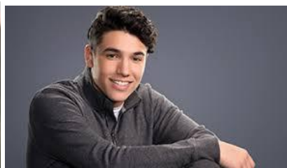
Horizontal photo not suitable