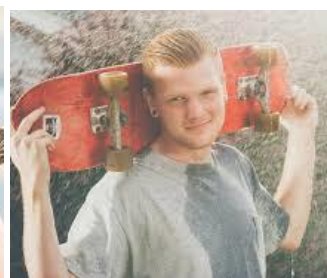
Prop used, fuzzy