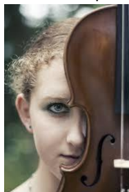
Prop, not full face