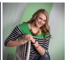
Awkward pose for yearbook