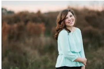
Awkward pose to crop for yearbook