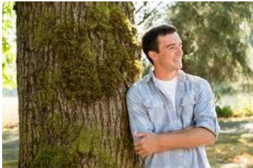
Looking away from the camera

These are lovely photos, but are not the composition we request for a more uniform yearbook appearance. The body poses cannot be cropped easily for a good yearbook head shot. Your vertical headshot yearbook photo should be able to be placed in the yearbook spread without our staff adjusting it. You should look at the camera.