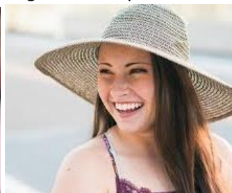
Hat; not looking at camera